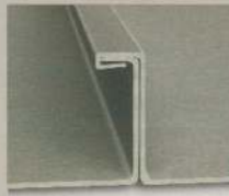
CB-150 AFTER SEAMING

Stiffening Ribs or Striations (ask for details)